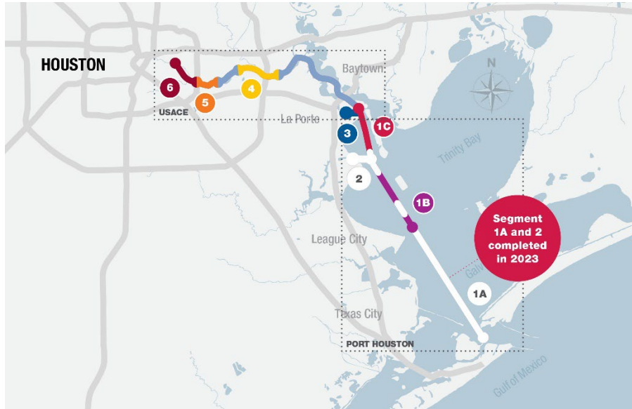
Houston Ship Channel Expansion - Project 11 Dredge Map. Segments 1A and 2 were completed in 2023.

The award to Callen Marine Ltd. marks Port Houston’s final Project 11 dredge contract, and its work will complete the channel reach through Galveston Bay underscoring the commission’s dedication to strategic infrastructure development for the betterment of the safety and efficiency of the channel. The remaining Project 11 segments will be carried out by the U.S. Army Corps of Engineers.