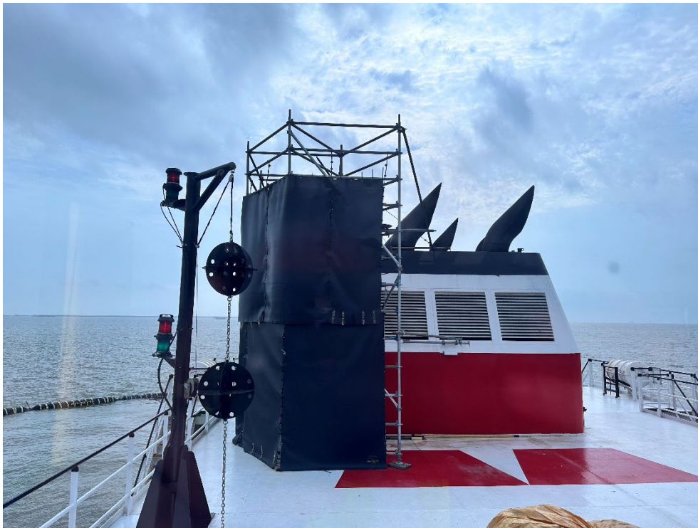
Photograph 1. Hydraulic Dredge Sound Mitigating Measures