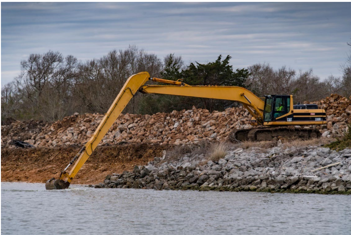
Photograph 2. Existing stone removal and stockpile