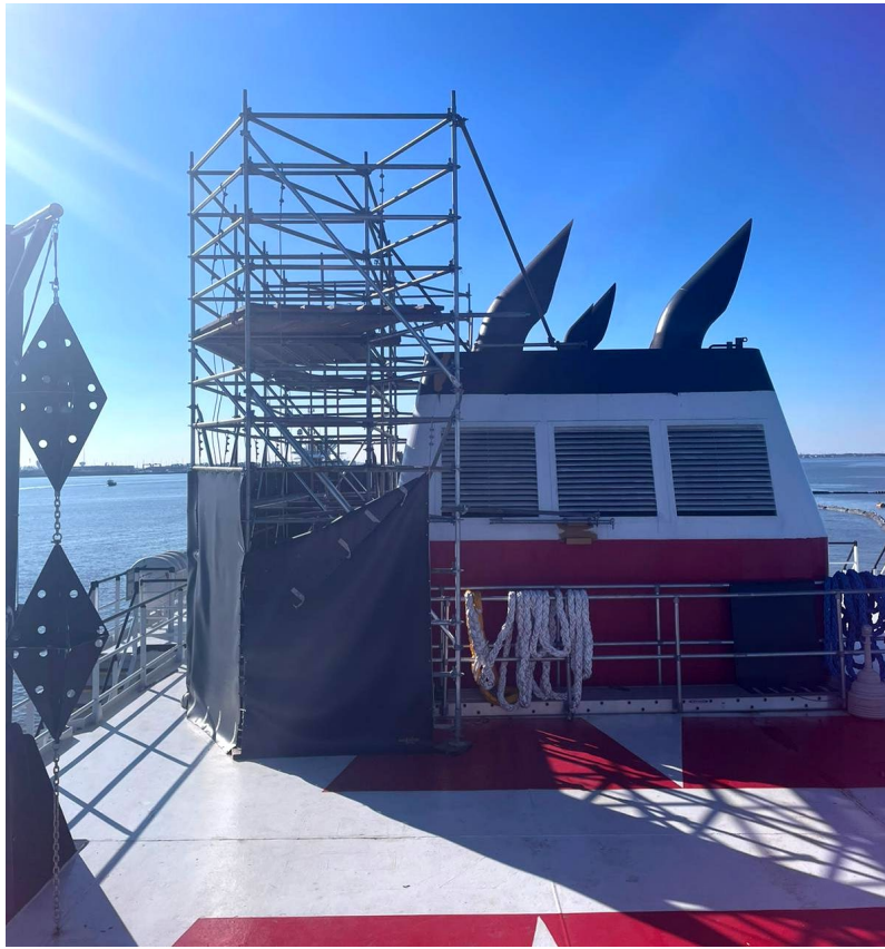
Photograph 1. Hydraulic Dredge Sound Mitigating Measures